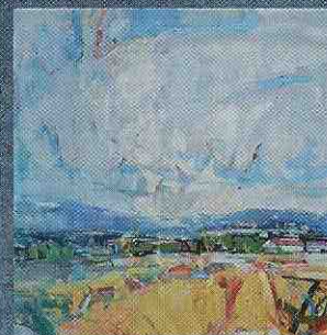
"A Pleasant Land"

Pieces in the collection: Let's Walk on the Far Ridge; A Pleasant Land