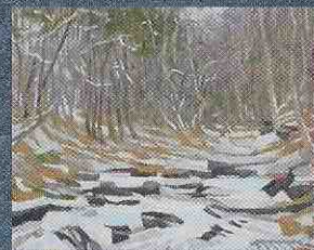
Wind and Rain Swept Field

Pieces in the collection: Wind and Rain Swept Field ; TYE River