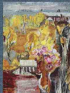
VMI Stone House

Pieces in the collection: View of VMI ; Lexington ; Institute Hill ; VMI Stone House