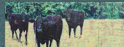
Four Cows and Aunt Zet's

Pieces in the collection: Four Cows and Aunt Zet's