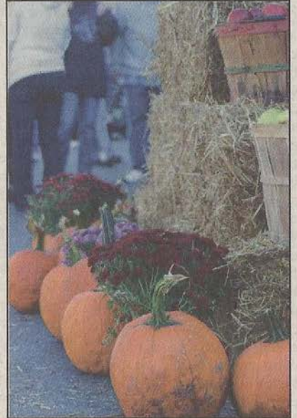
Among the displays and booths at the annual Mountain Day in Buena Vista were pumpkins (above) and intricately carved walking sticks.